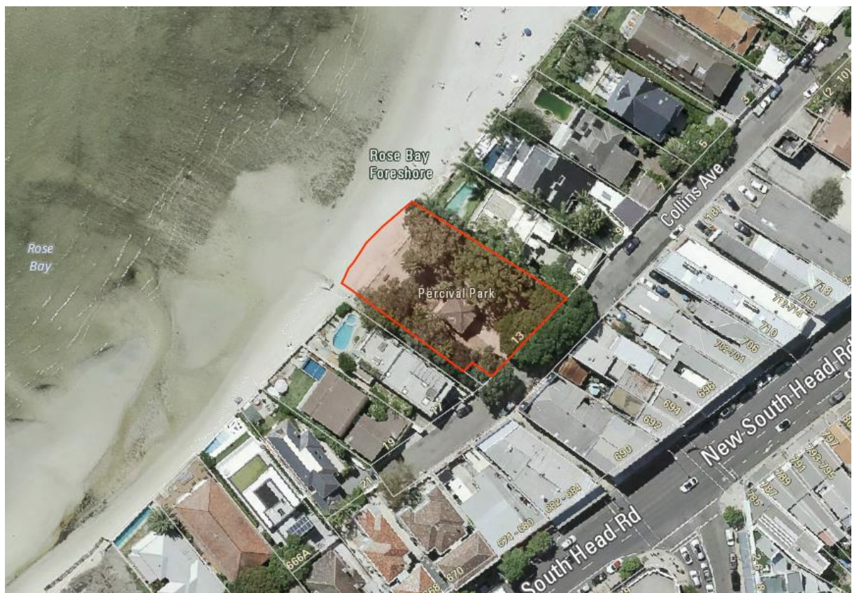
Figure 2: 2018 aerial photograph of site