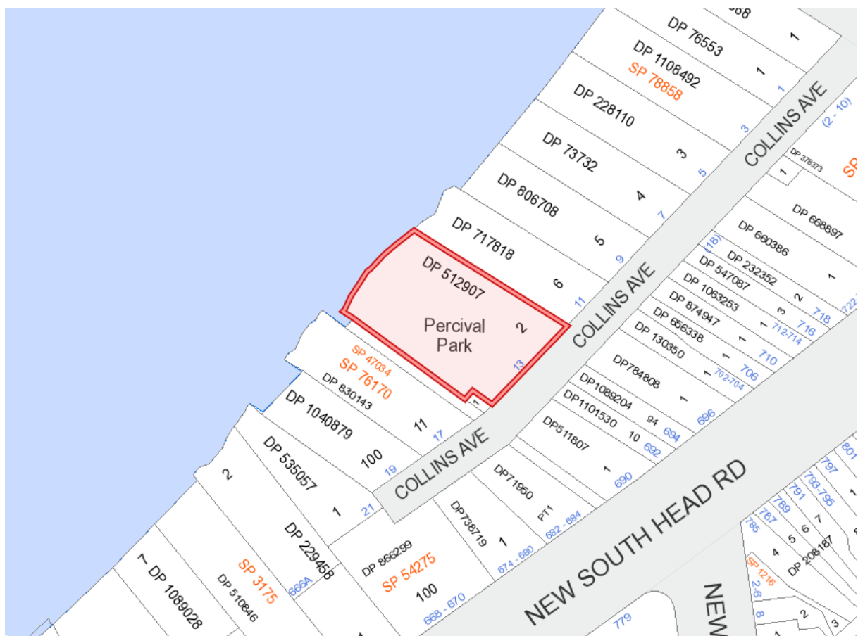
Figure 3: Cadastral map of Percival Park with the site outlined in red.